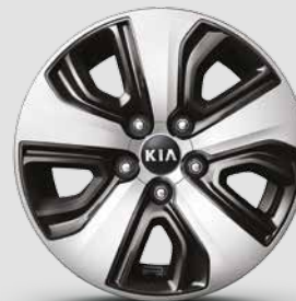
16" alloy wheels with wheel covers